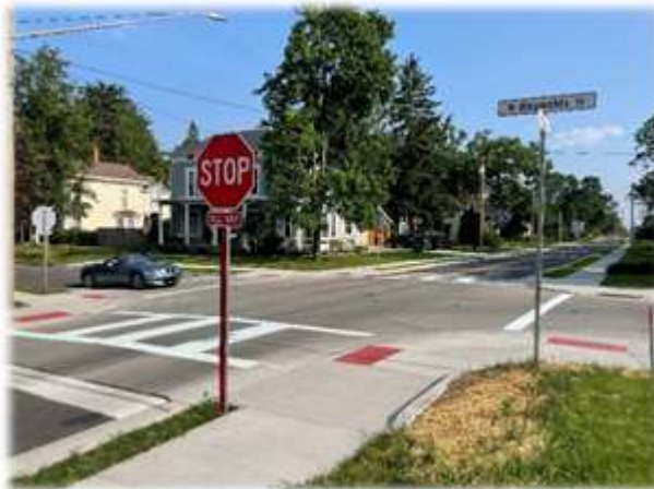
South High Street/West Reynolds Street Intersection (June 2025)